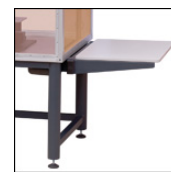
Click to Enlarge PSY350 Side Shelf Mounted via the PSY401 Post and Side Shelf Adapter

The PSY401 post and side shelf adapter maximizes the mounting capabilities when using a ScienceDesk™ with a Faraday enclosure. It offers seven through holes for ScienceDesk™ stainless steel posts and allows for use of our post-mounted ScienceDesk accessories. Additionally, this adapter allows the PSY350, PSY352, or PSY353 side shelf to be attached to a ScienceDesk frame equipped with an enclosure, thereby providing a large work surface separate from the isolated experiment, as shown in the photo to the right.