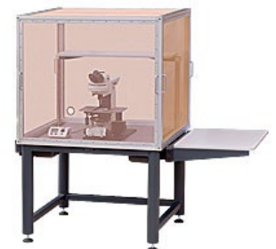
Click to Enlarge [APPLIST] [APPLIST] A Typical Faraday Enclosure Setup

Experiments in electrophysiology, confocal microscopy, and other sensitive applications often need to be shielded from external interference from electrostatic fields and electromagnetic waves generated by AM/FM radio, CRT oscilloscopes, fluorescent lights, and other common lab equipment. Thorlabs' ScienceDesk™ Faraday Enclosure consists of a taut copper mesh that protects against these external sources of interference.